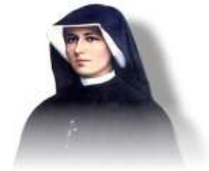
St. Faustina Kowalska