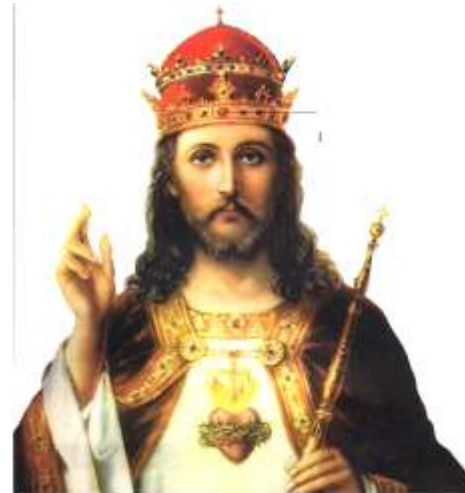
Christ the King

November 25, 2012 ~ Christ the King of the Universe